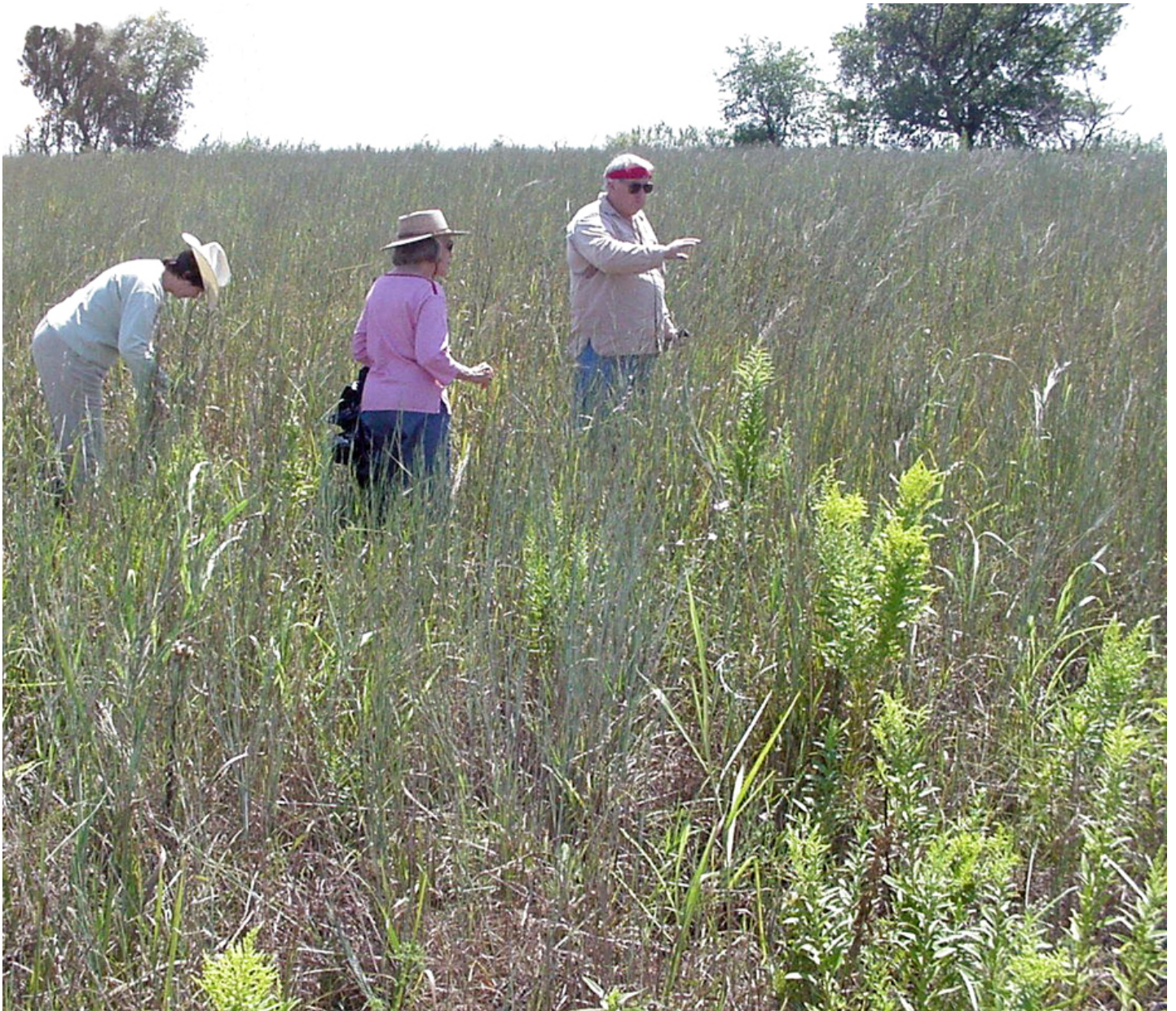
Grassland – Black Prairie, Illinois