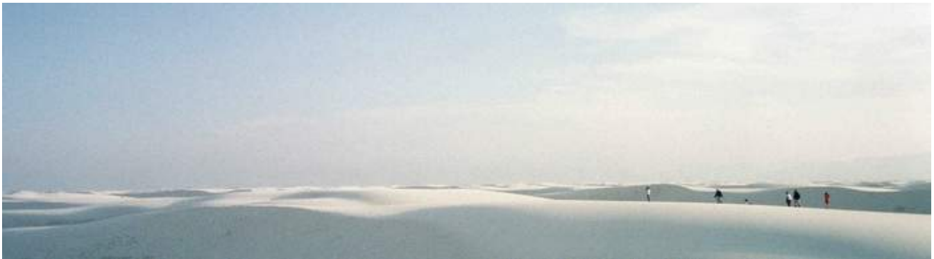
Desert - White Sands National Monument, New Mexico