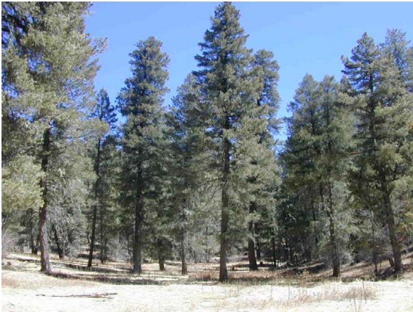
Coniferous Forest (Taiga) - Lincoln National Forest, New Mexico